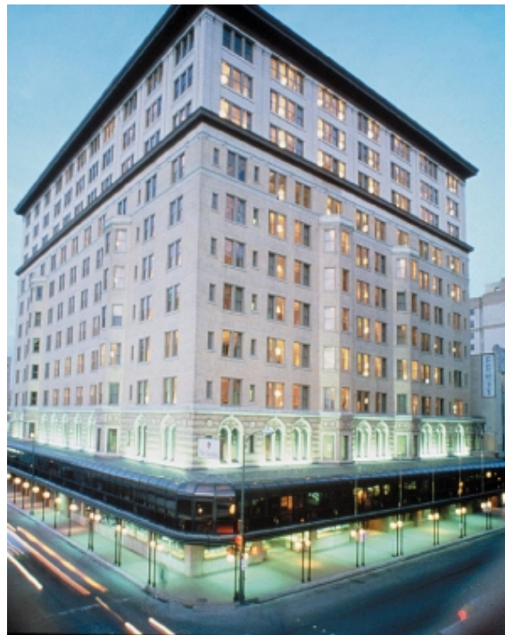
Pictured above: The Sheraton Gunter Hotel 205 East Houston Street San Antonio, Texas 78205 Website: www.gunterhotel.com .

Make reservations on-line at www.ou.edu/scmla . Click on Make Reservations at Sheraton Gunter Hotel on our main page.